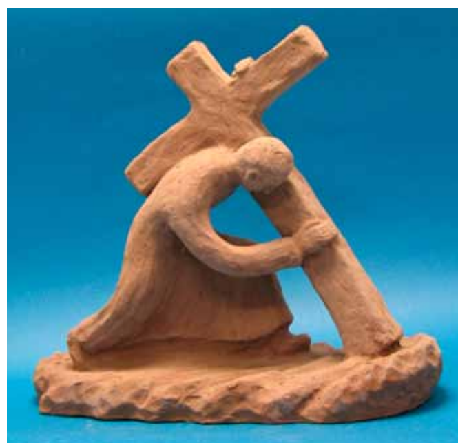
Figure 2.3.4. Gerfried Schellberger, Heavy Load , 1986. Clay, 30 cm x 27 cm x 18 cm.