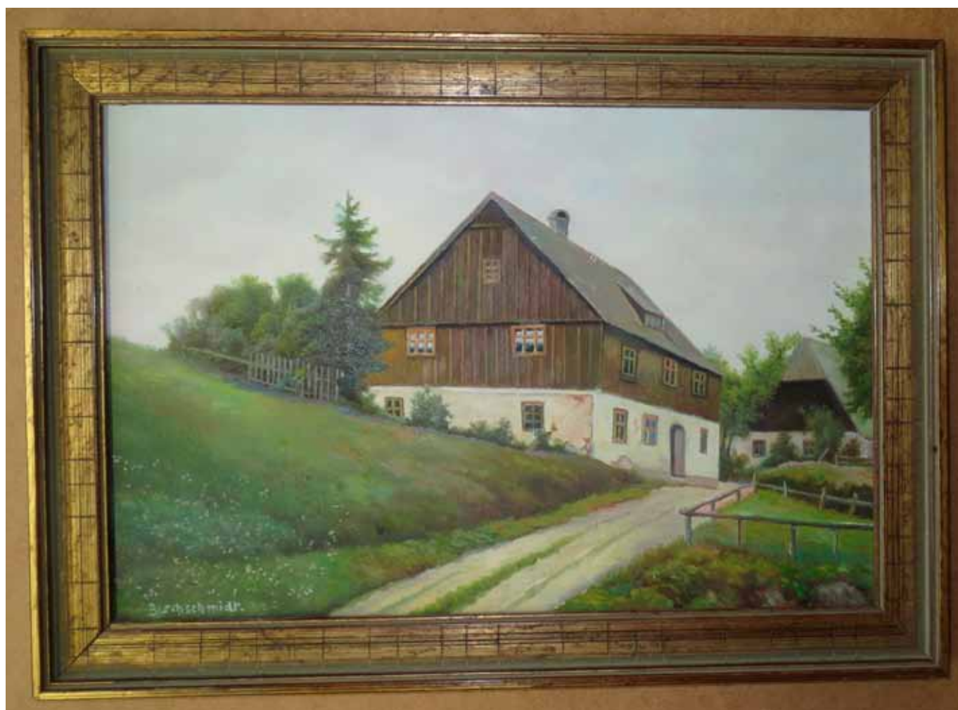
Fig 2.3.1: Blechschmidt, untitled, oil painting of a house in the Sudetenland, 28cm x 39.5cm.

The gift signifies his continued attachment to the old family house, and highlights Matz's Sudeten German roots. In the second half of the twentieth century, this type of painting became quite common. It was produced for expellees in response to a strong demand for material reminders of the lost Sudetenland which were scarce, due to the fact that the expellees had been forced to leave most of their property behind. Professional painters offered the service in Heimatbriefe and Heimatbote , journals and newsletters that were produced by expellees for the purpose of trying to stay in touch (Fendl, 2013). Evidently, since expellees elderly enough to remember the old Sudetenland are dying out, some of their offspring, such as Matz's, have decided to donate the works to museums. In their