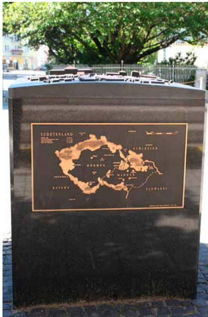
Fig 2.3.5. Monument for the homeland-expelled Sudeten Germans. Bronze, Furth im Wald.

Some memorials refer to the relocation of the expellees or their integration in new countries of settlement. In the German town of Furth im Wald, for example, Denkmal der heimatvertriebenen Sudetendeutschen (Monument for the homeland-expelled Sudeten Germans) contains references both to the lost homeland and to a camp where some expellees were housed after their arrival. The camp remained in use until 1958. The monument has a block-like structure and on its front is a bronze map of the Czech Republic, with the Sudetenland marked as separate territory (see Figure 2.3.5).