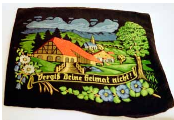
Fig 2.3.7: Embroidered Pillowcase.

of artefacts in new spatial and discursive contexts calls for a processual perspective on aesthetic practice. In my previous work, I used the perspective of 'aestheticisation' to explore how artefacts and images in transit (i.e. appearing in new times and places), gain new meanings, values and emotional efficacy, for example making transitions from 'art' to 'pornography', from 'kitsch' to 'craft', or from 'art' to 'propaganda' (Svašek, 2007). Reproduced or exhibited in different media and venues, Sudeten German cultural productions, such as images of family homes or people in folk costumes, have also been 'aestheticised' in new ways. The oil painting discussed earlier (Figure 2.3.1), for example, was given to the Sudetendeutsche museum in Munich in 2013, thus becoming part of a wider story of Sudeten German cultural history.