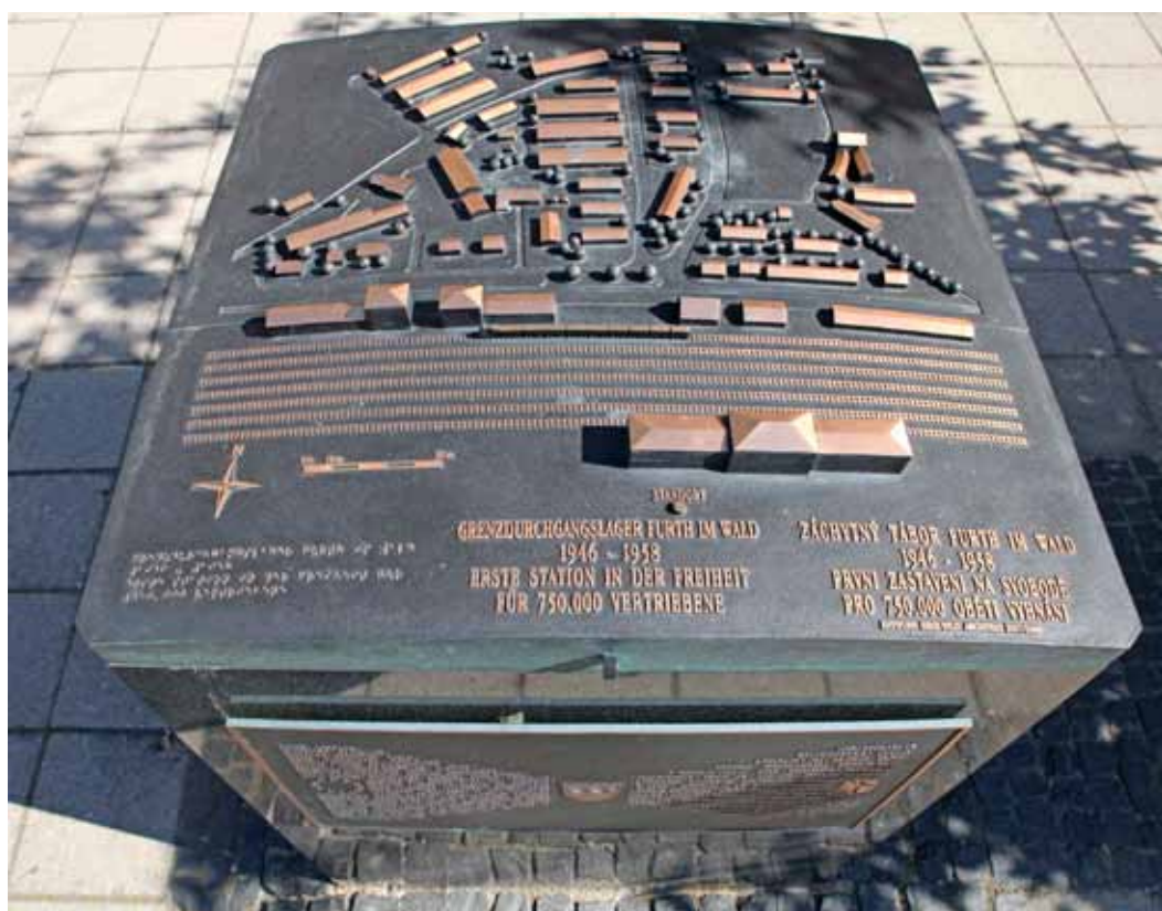
Fig 2.3.6. Monument for the homeland-expelled Sudeten Germans. Furth im Wald.