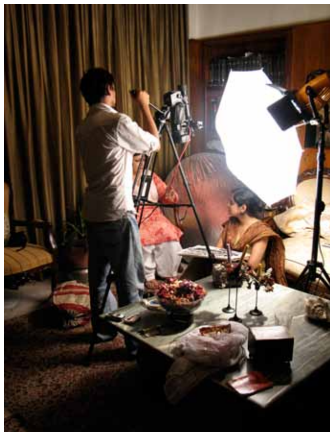
Fig 2.3.11. Camera set up during one of the interviews, courtesy of Sophie Ernst.

Ernst documented the conversations, making sound recordings and filming the sketching hands. On the basis of the resulting drawings, she then created three-dimensional architectural models out of white material (Figure 2.3.11). In the final installation, she projected