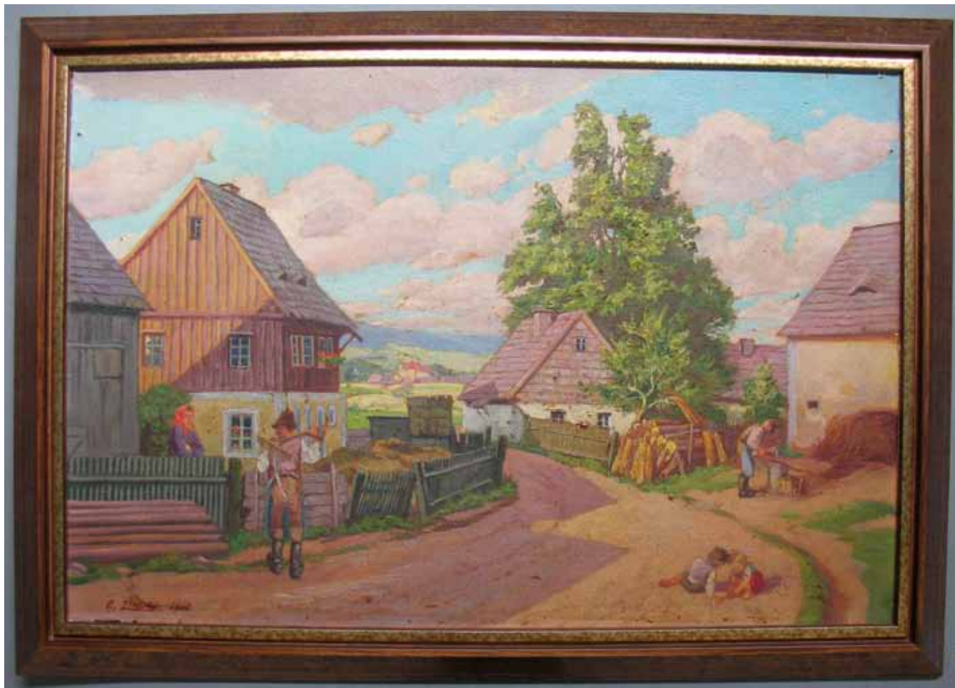
Fig 2.3.2: Gustav Zindel, untitled, painting of a village scene in the Sudetenland, 1952. Courtesy of the Sudetendeutsches Museum, Munich.

transition to larger collections, the items partially lose their more personal meaning and are reframed as examples of a specific genre, signifying both 'Sudeten German culture' and 'collective displacement'.