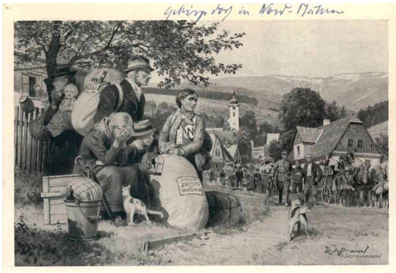
Fig 2.3.8: Richard Assmann, painting reproduced on a Postcard, 1950s.

checked their luggage, others sitting on their trunks, their faces expressing despair. Figure 2.3.8 shows a similar scene, painted by Richard Assmann in the 1950s. Reproduced on and circulating as postcards amongst the expellees, these images strengthened notions of collective trauma.