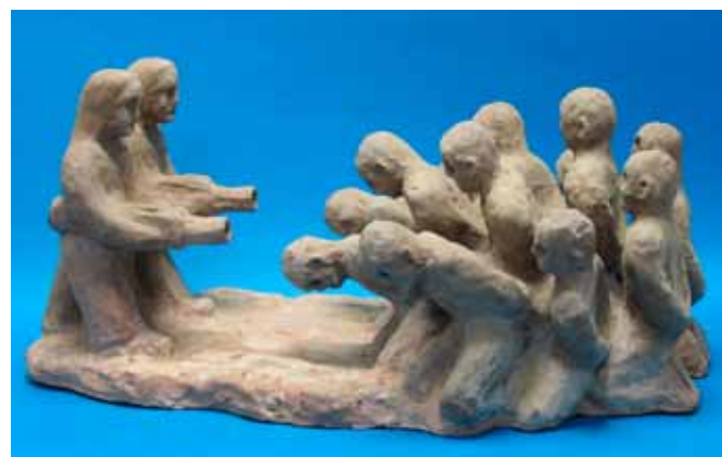
Fig 2.3.3. Gerfried Schellberger, Massacre , 1986. Clay, 21 cm x 47 cm x 27 cm. Courtesy of the Sudetendeutsches Museum, Munich.

Especially in Bavaria, where most Sudeten German expellees settled, numerous memorials have been unveiled since the 1950s, creating ritual sites to commemorate Sudeten German victims of crimes committed during the expulsion, and the loss of the